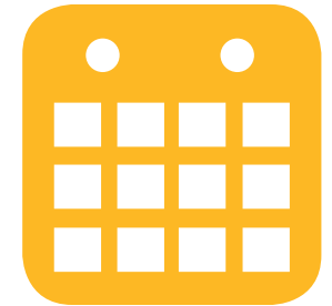
Energize Eastside Dependable power for years to come