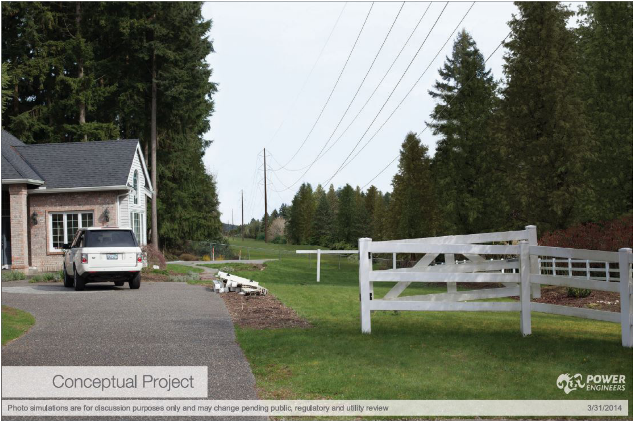
NE 54th PI - Segment C