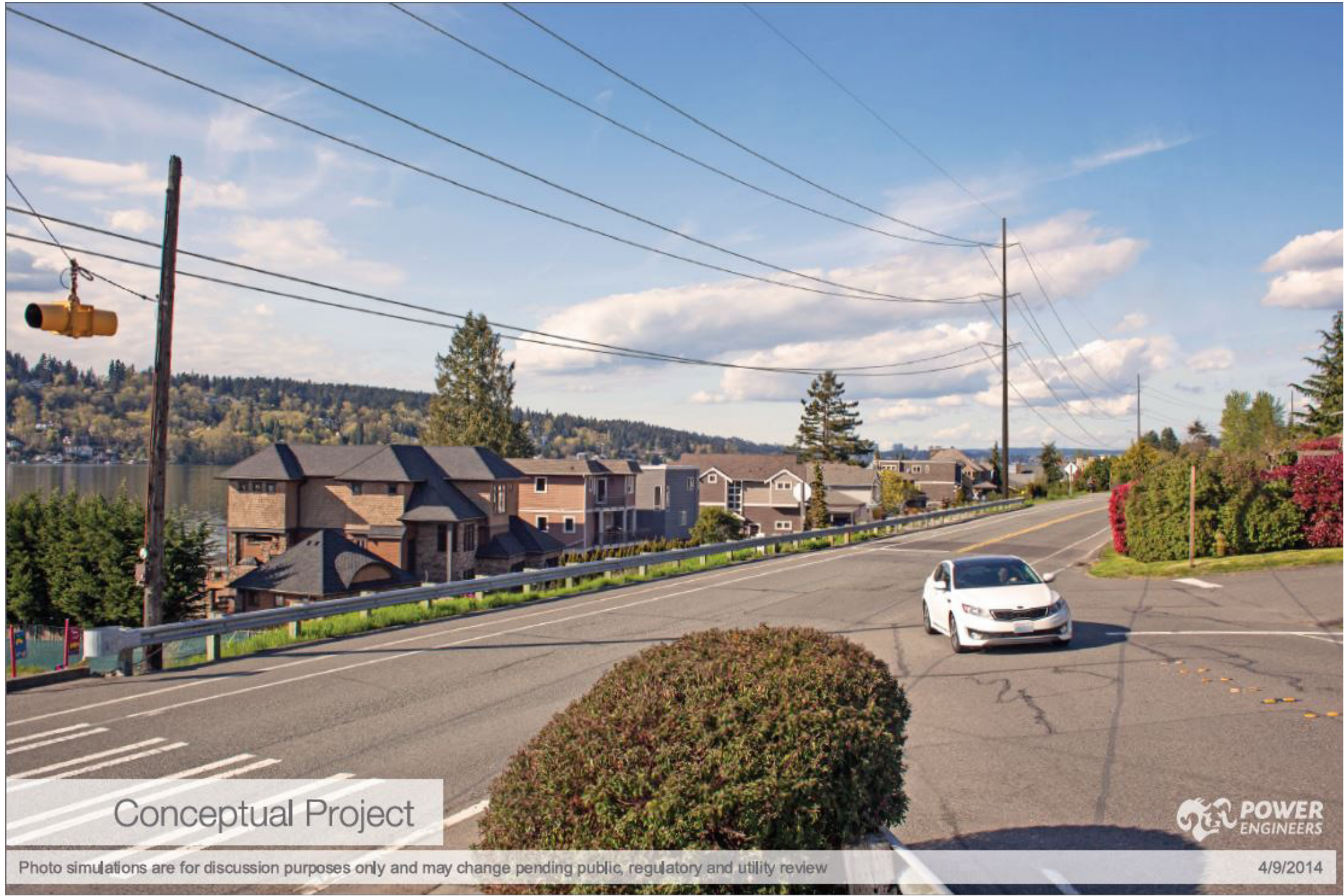
Lake Washington Blvd N - Segment L