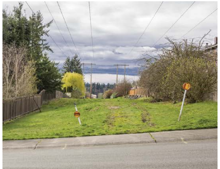
PSE's transmission lines have safely shared the existing utility corridor with Olympic Pipeline for 40 years.

We coordinate closely with Olympic Pipeline now and will continue to keep each other informed of activity within the corridor during and after construction.