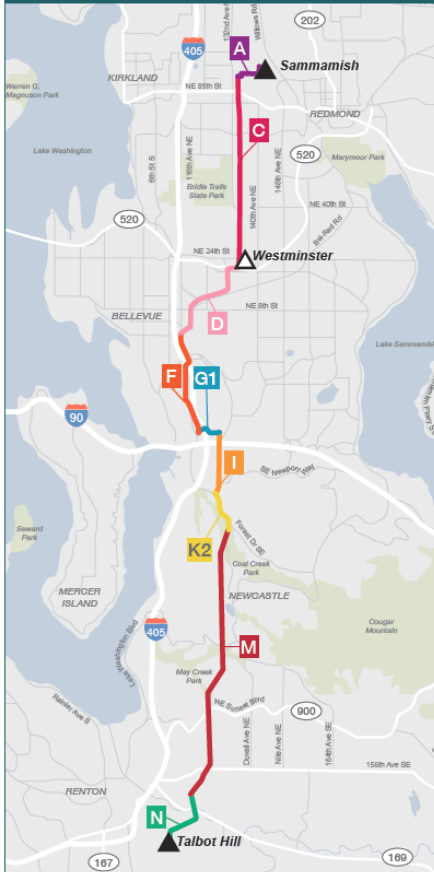
ASH (Segments A-C-D-F-G1-I-K2-M-N)