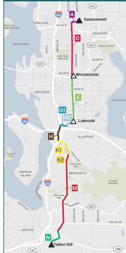
REDWOOD (Segments A-C-E-G2-G1-H-K1-K2-M-N)