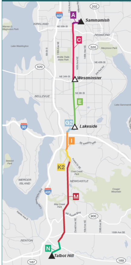
OAK (Segments A-C-E-G2-I-K2-M-N)