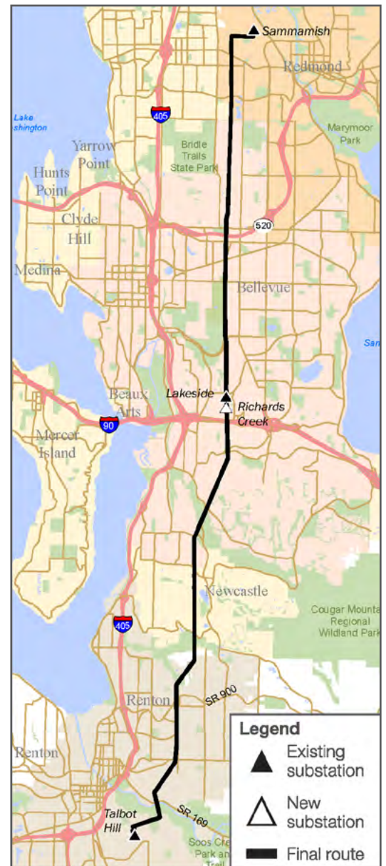
After evaluating multiple routes, PSE selected the existing corridor as the final route for the project.